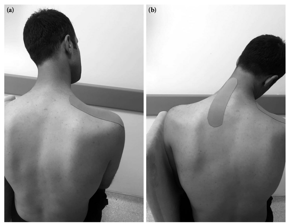
Figure 3. (a) Kinesiotaping technique of trapezius muscle. (b) Kinesiotaping technique of levator scapula muscle.

Group 1 were treated with DN (n=30). The patients of the DN group were carefully examined, and their two most painful trigger points received DN. To identify trigger points, taut bands were examined and the most painful area causing referred pain in