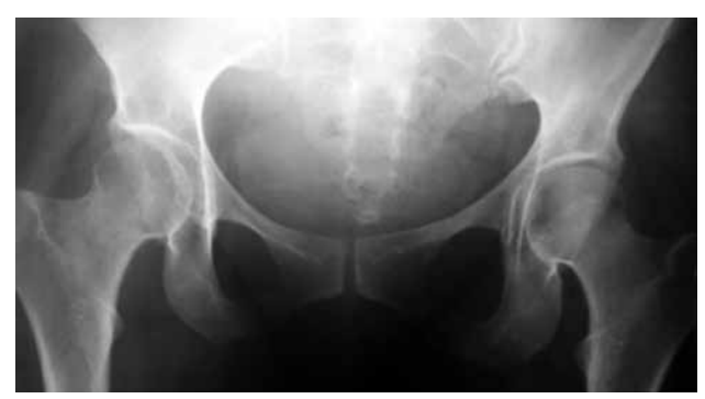
Figure 1. Direct radiography of the hip.

history. History of use of steroids or similar drugs was not present. Her calcium intake was insufficient and she did not take calcium supplements. A written informed consent was obtained from the patient.