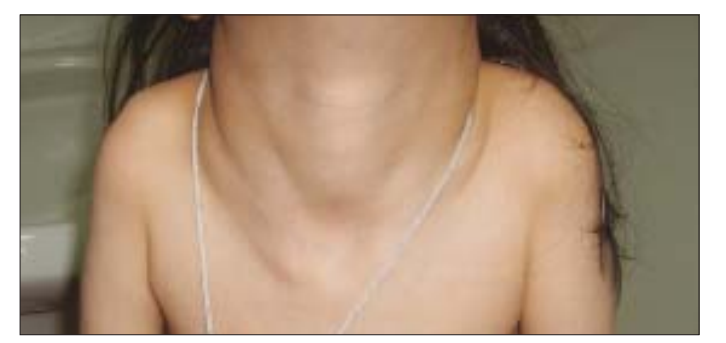
Figure 1. Muscle atrophy in both arms.

Table 1. The electrophysiological findings of the patient