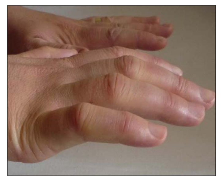
Picture 1. The MCP joints were at hyperextension, and PIP and DIP joints were slightly at flexion.

Peripheral neuropathy that occurs secondary to hemorrhage proximally in the lower extremities may develop due to